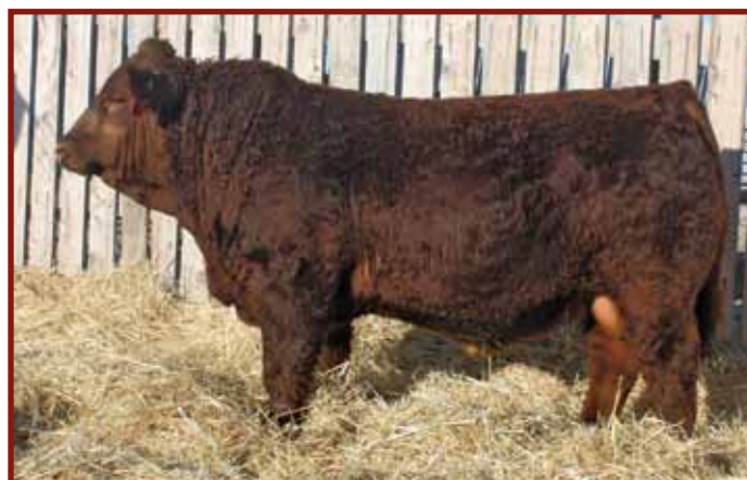
Sunny Valley Matrix 32E