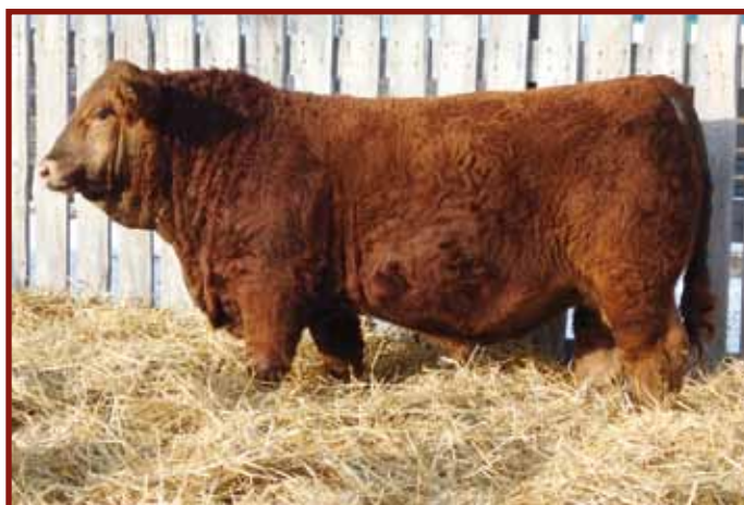
RKTS Remuda 29E