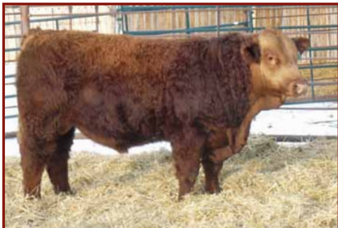
AEDJ Copper 218C