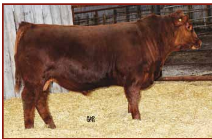
Red OBCC Kargo H3D